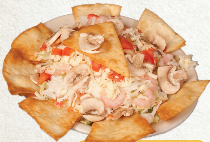
BAJA SEAFOOD SALAD

Shredded lettuce, tomatoes, olives and cheese with your choice of dressing.