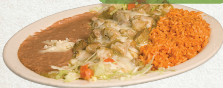
CHILE VERDE BURRITO

Seasoned pork simmered in green chili sauce and wrapped in a flour tortilla and topped with more Verde sauce and Monterey Jack cheese.