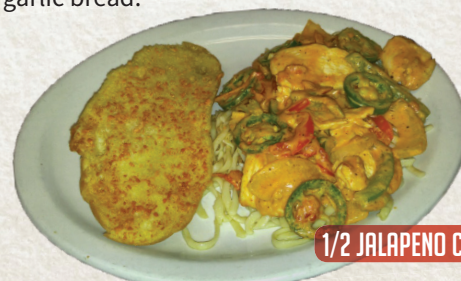
1/2 JALAPENO CHICKEN CREAM CHEESE

A combination of sautéed jalapeños, tomatoes, onions, red peppers and green peppers in a seasoned cream cheese sauce. Placed on top of a bed of sautéed garlic linguine noodles. Served with garlic bread.