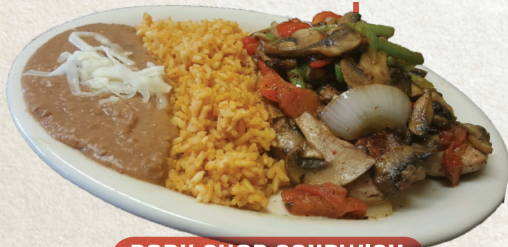
PORK CHOP SANDWICH