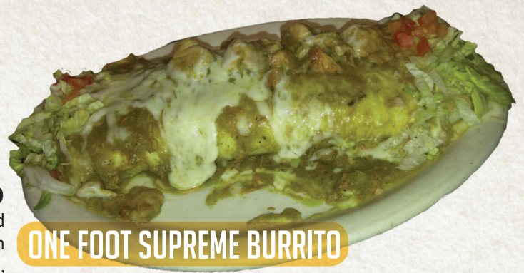
ONE FOOT SUPREME BURRITO