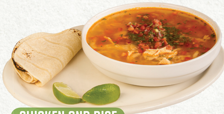
CHICKEN AND RICE

A combination of our shredded chicken, rice and pico de gallo boiled together in a chicken broth, served with your choice of corn or flour tortillas.