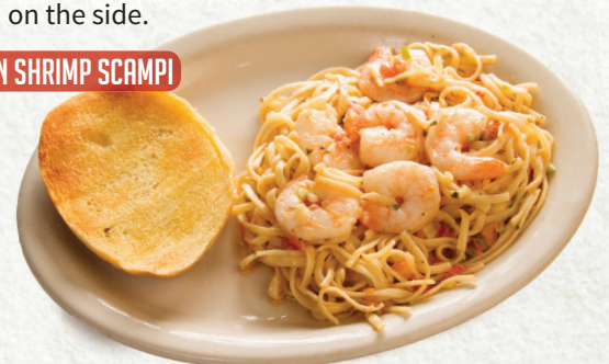
1/2 MEXICAN SHRIMP SCAMPI

Shrimp and linguine noodles sautéed in our garlic sauce and fresh pico de gallo with a Parmesan and Romano blend cheese. Served with garlic bread on the side.