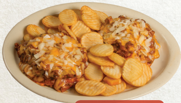
IGUANA CHILI BURGER

Two beef patties served on an open-face hamburger bun, then topped with Chili Colorado, cheddar cheese and fresh onion. Served with a side of cottage fries or a salad.