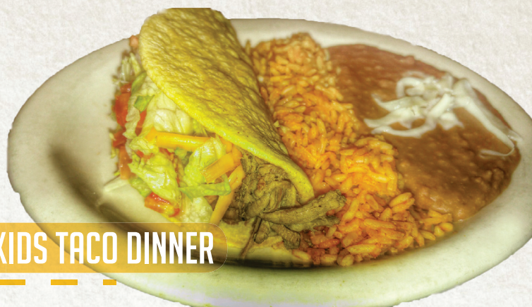
KIDS TACO DINNER