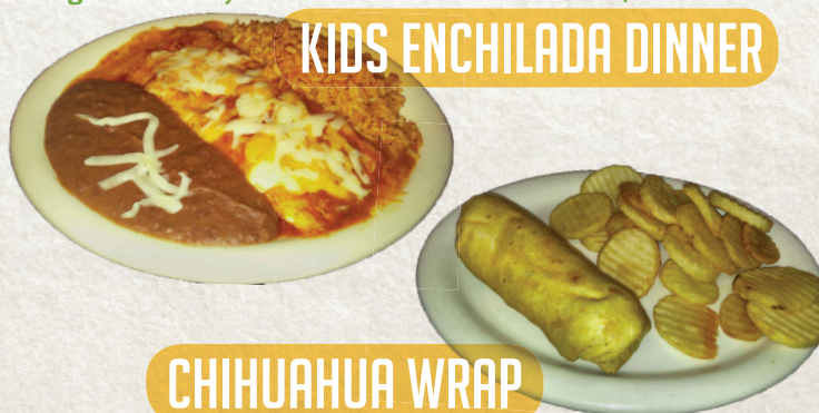
KIDS ENCHILADA DINNER

Add ground beef, shredded beef or chicken for $0.99.