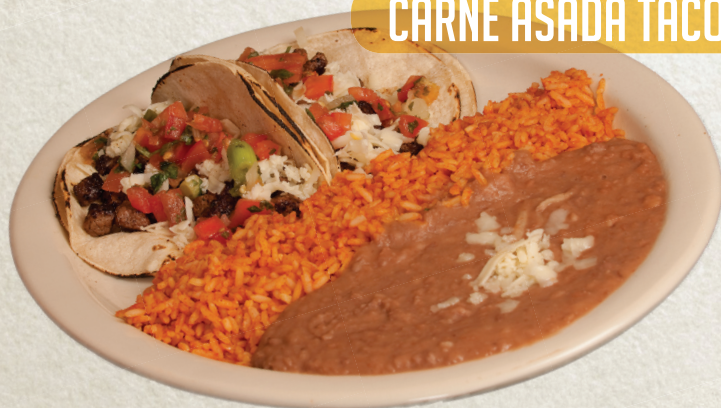
CARNE ASADA TACOS

Mexican version of pulled pork, served in a grilled corn tortilla, topped with cilantro and onions.