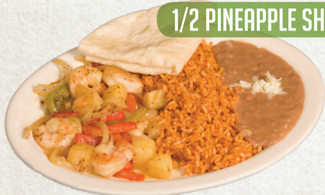
1/2 PINEAPPLE SHRIMP

Sautéed with green and red peppers, onions and tomatoes in a well-spiced pineapple sauce. Served with rice & beans and two tortillas on the side.