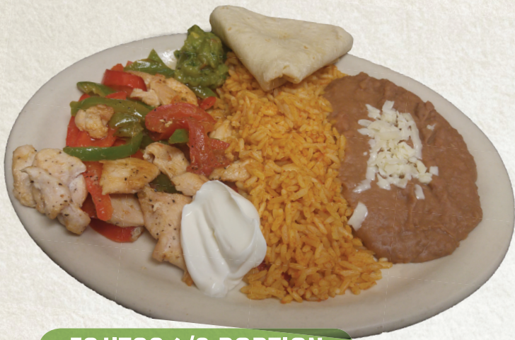
FAJITAS 1/2 PORTION