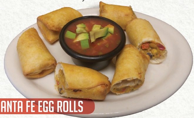
SANTA FE EGG ROLLS

Three small burritos deep fried and stuffed with pepper jack cheese, corn, red peppers, spinach, chicken, black beans and jalapeños. Served with our zesty cocktail sauce.