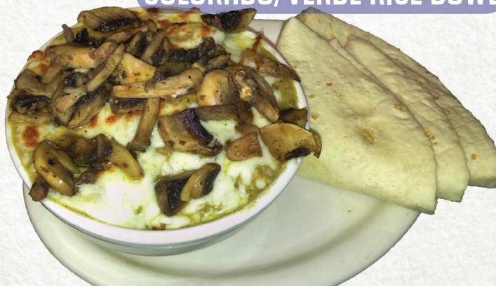
COLORADO/VERDE RICE BOWL

Verde Rice Bowl ..... $7.99 Seasoned pork simmered in green chili sauce over a bowl of rice, topped with Monterey Jack and sautéed mushrooms with two tortillas on the side.