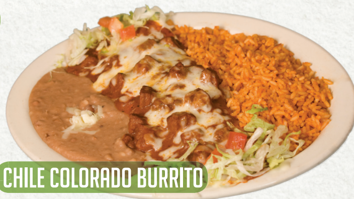
CHILE COLORADO BURRITO

Chile Colorado Burrito ..... $7.99... $10.99 ... $13.99