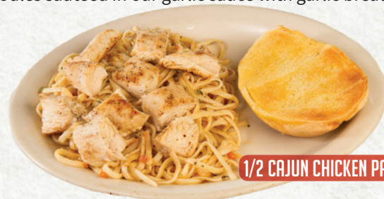
1/2 CAJUN CHICKEN PASTA

Grilled chicken in our own blend of Cajun seasoning with linguine noodles sautéed in our garlic sauce with garlic bread on the side.