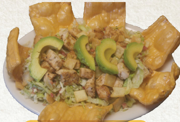
AZTEC CHICKEN SALAD